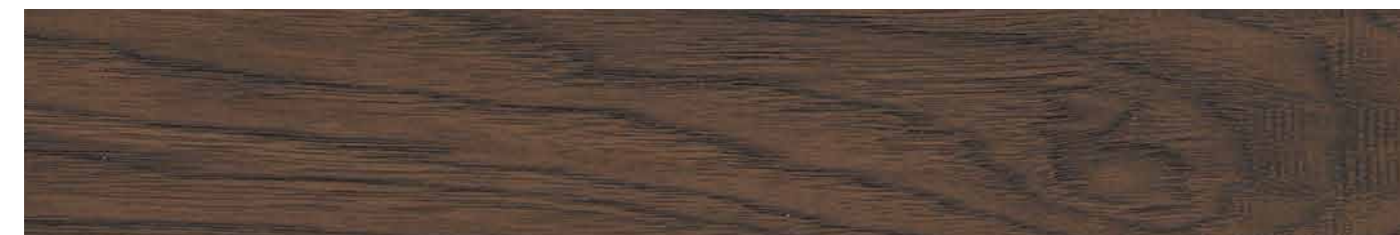
FVW-71066 1220mm x 167mm 6+1,5(cork) mm

ENVIRONMENT PROTECTION SAFETY ECO-FRIENDLY v Underfoot Comfort Sound Insulation Thermal Insulation Water Proof