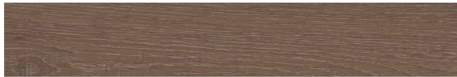
FVW-71057 1220mm x 167mm 6+1,5(cork) mm