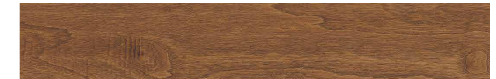
FVW-71061 1220mm x 167mm 6+1,5(cork) mm