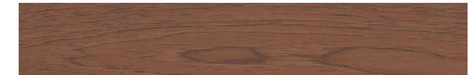
FVW-71062 1220mm x 167mm 6+1,5(cork) mm