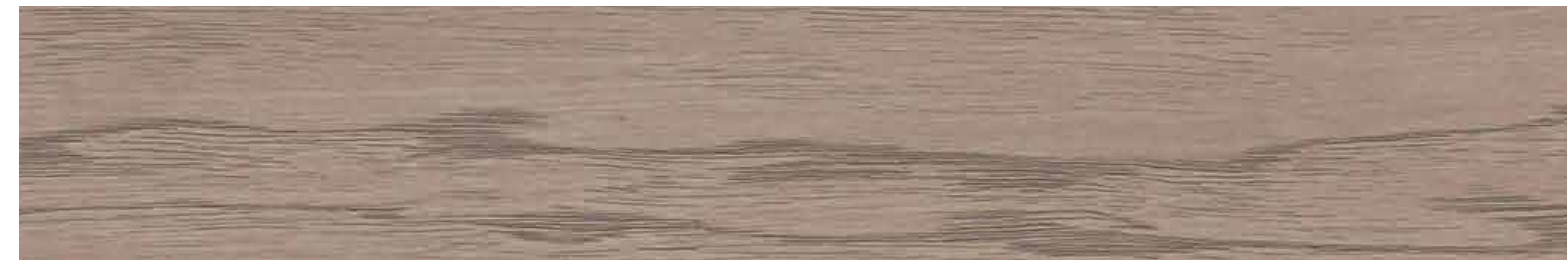
FVW-71051 1220mm x 167mm 6+1,5(cork) mm