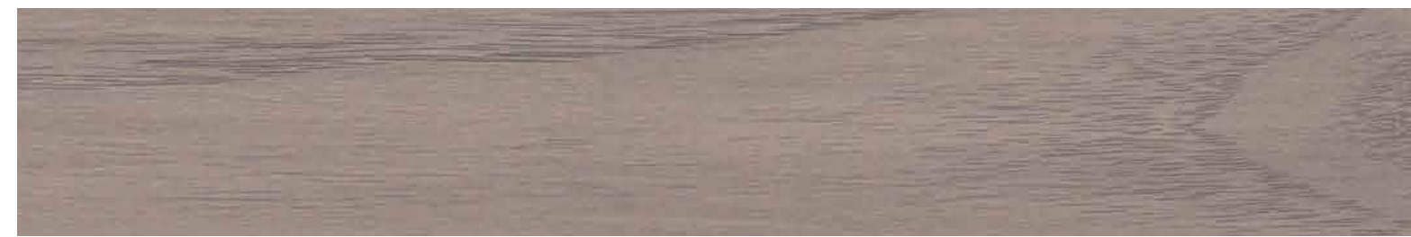
FVW-71053 1220mm x 167mm 6+1,5(cork) mm