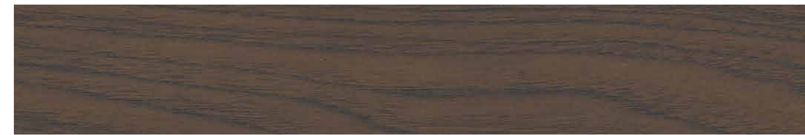
FVW-71065 1220mm x 167mm 6+1,5(cork) mm