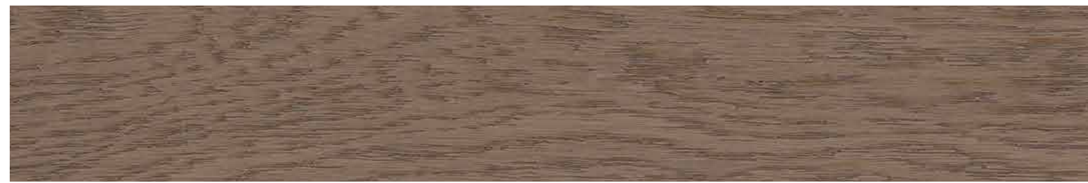
FVW-71056 1220mm x 167mm 6+1,5(cork) mm