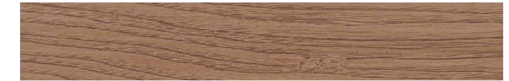
FVW-71060 1220mm x 167mm 6+1,5(cork) mm