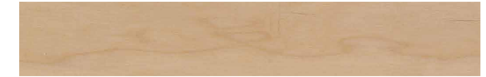
FVW-71059 1220mm x 167mm 6+1,5(cork) mm