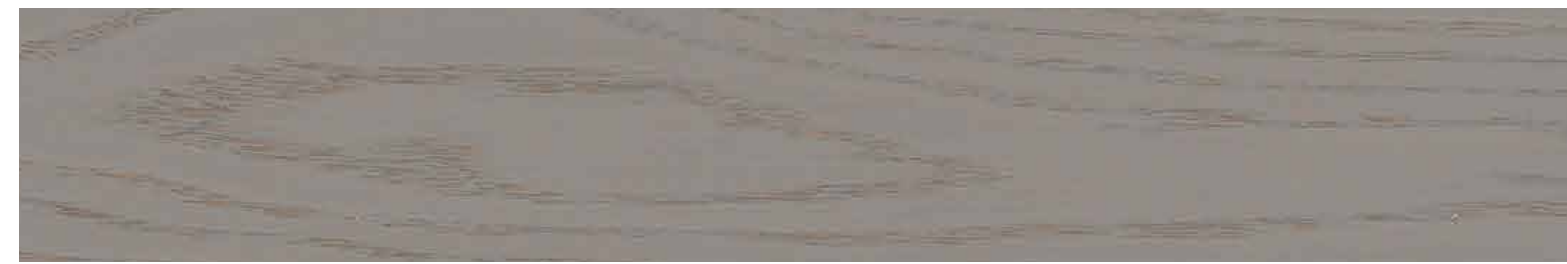
FVW-71052 1220mm x 167mm 6+1,5(cork) mm