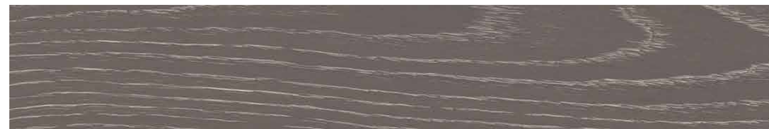
FVW-71054 1220mm x 167mm 6+1,5(cork) mm