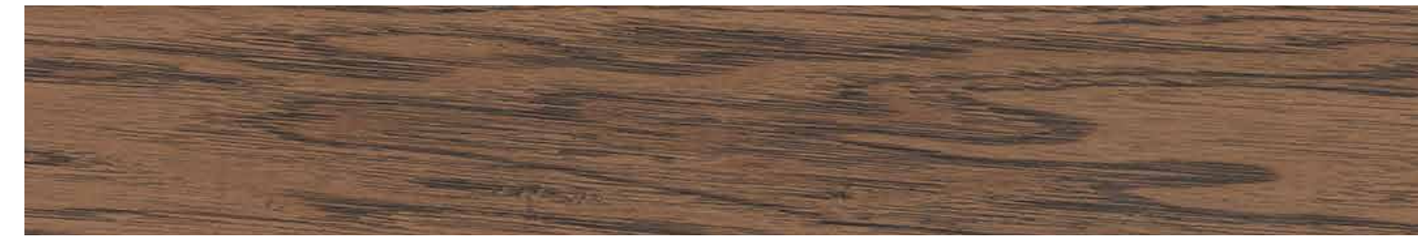
FVW-71063 1220mm x 167mm 6+1,5(cork) mm