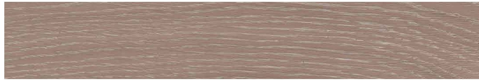
FVW-71055 1220mm x 167mm 6+1,5(cork) mm