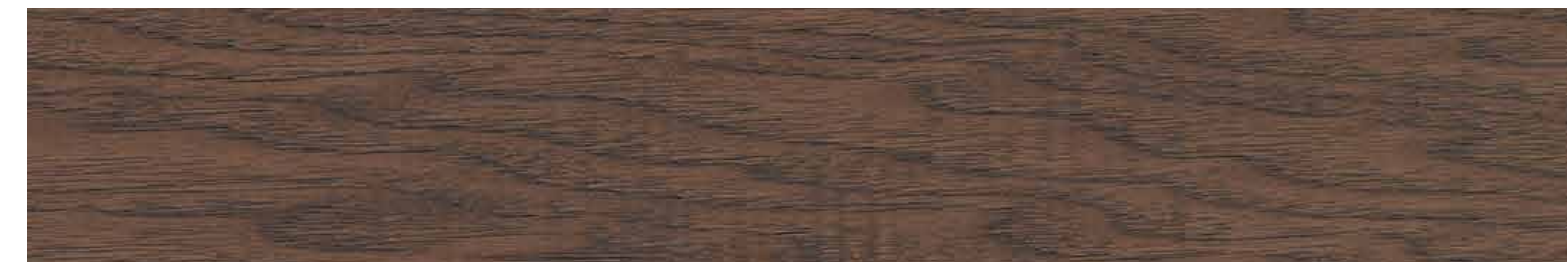
FVW-71064 1220mm x 167mm 6+1,5(cork) mm