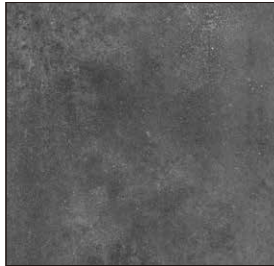
FTS-33059 912mm x 456mm 3.0mm