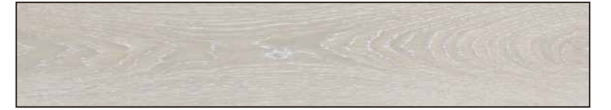
FTW-31090 1227mm x 190mm 3.0mm