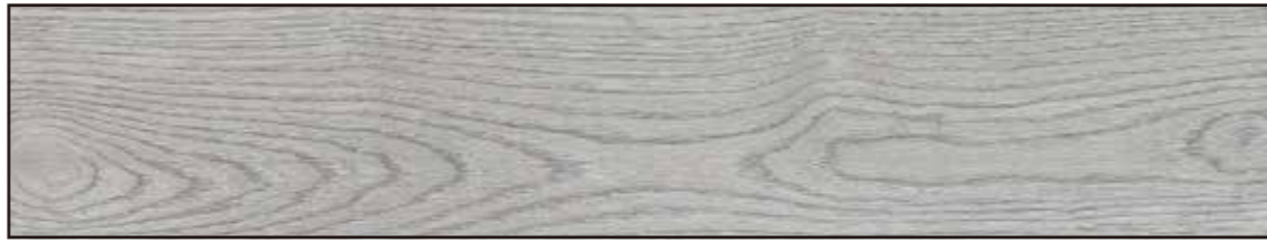
FTW-31084 1227mm x 190mm 3.0mm