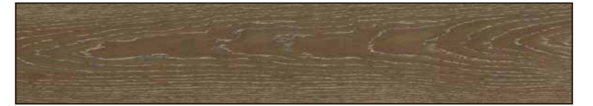
FTW-31094 1227mm x 190mm 3.0mm