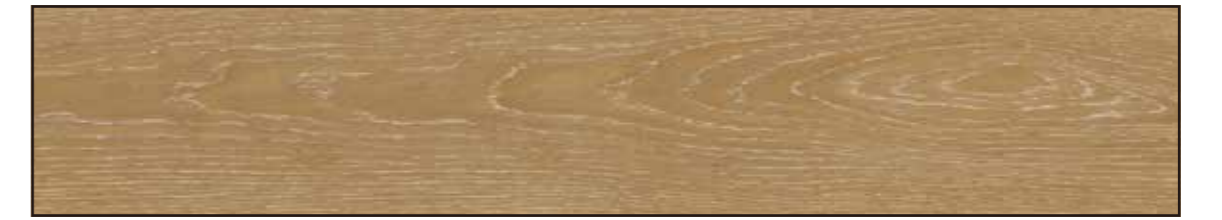
FTW-31093 1227mm x 190mm 3.0mm