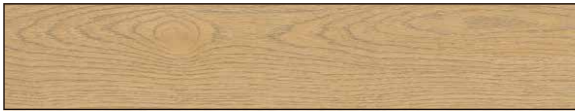
FTW-31085 1227mm x 190mm 3.0mm