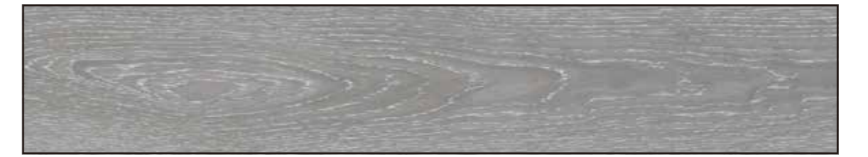
FTW-31091 1227mm x 190mm 3.0mm