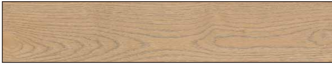
FTW-31086 1227mm x 190mm 3.0mm